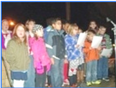
“God Bless America” was sung by students of New Castle Christian Academy, St. Vitus & American Heritage Girls.

NOTE: A two minute video with clips of the program at Kennedy Square is still at the New Castle News website. The link is at our website.