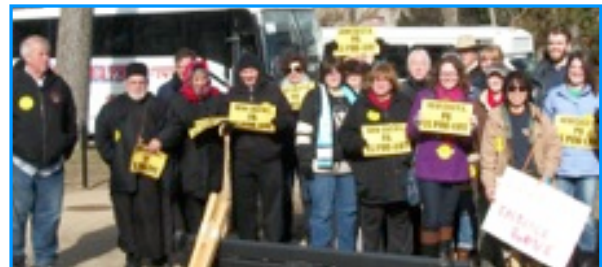
The rally prior to the March for Life began at Noon.